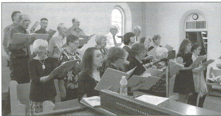
ABOVE: VHS alumni join voices in the choir loft for 2014 Homecoming Memorial Mass in the Basilica of St. Fidelis.

Homecoming 2014 saw a few changes from years past. The annual banquet location was changed from the Fanchon in the past to the Hays VFW Hall. Change brings new opportunities, and, all in all, the same Victoria spirit was ever present the evening of the banquet.