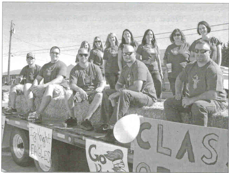
The large group from the Class of 2003 were able to participate in the 2013 Homecoming Parade.