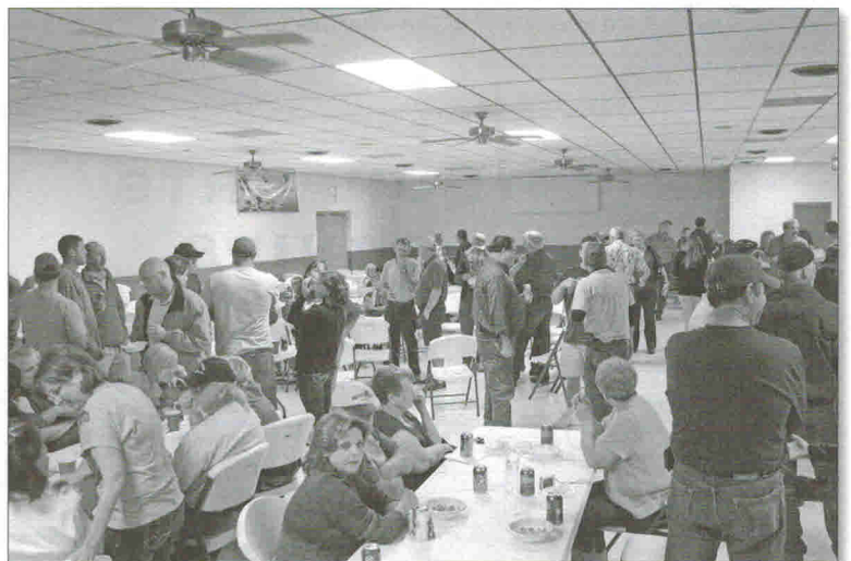
Alumni and friends enjoy the get-together held at the V.F.W. Hall in Victoria after the 2013 Homecoming game.

Your cost for all of this entertainment at both VFW Halls remains quite reasonable. You can find that information on the last page of this newsletter.