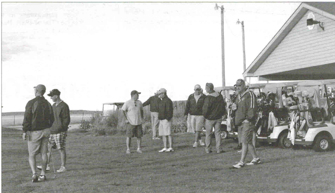
Some of the golfers participating in the 2013 Annual VHS Alumni Golf Tournament gather around club house, their golf carts nearby and ready to take them on another fun adventure.