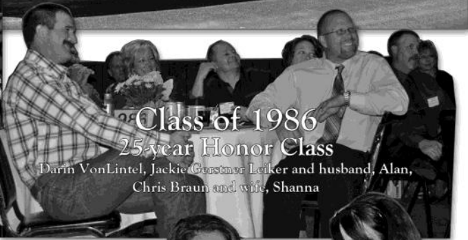
Class of 1986 25-year Honor Class