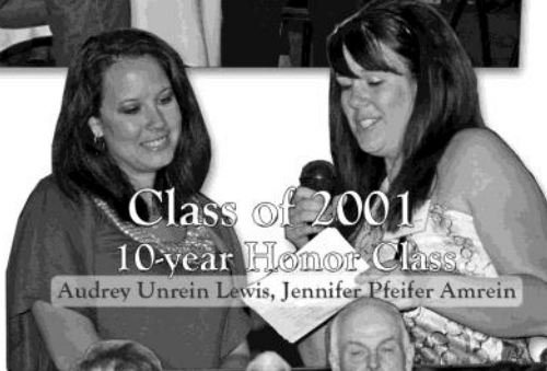
Class of 2001 10-year Honor Class