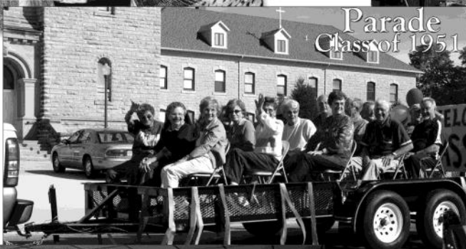
Parade Class of 1951