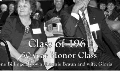
Class of 1961 50-year Honor Class